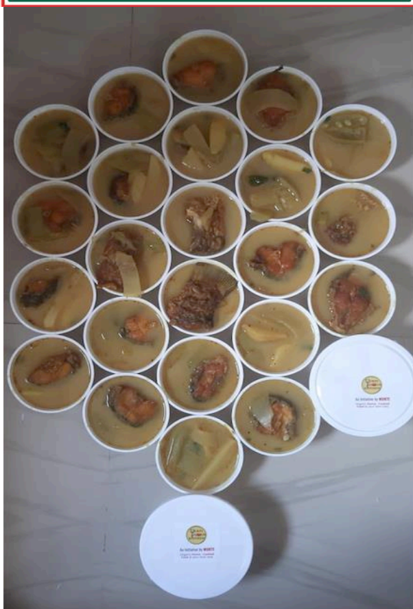
Figure 3 Over 5000 meals were delivered to homes in Kolkata and Howrah