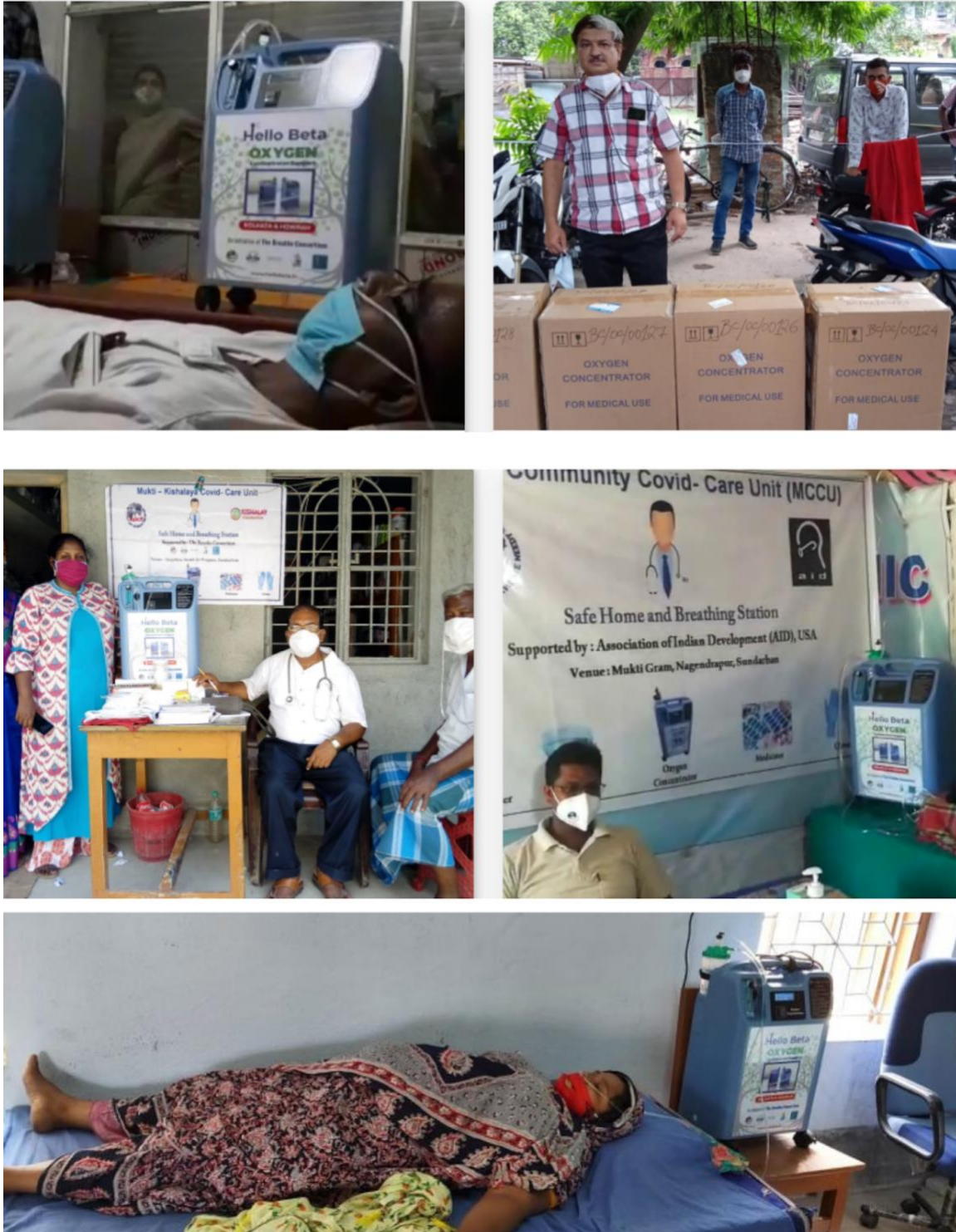
Figure 1 Project Breathe Social Impact